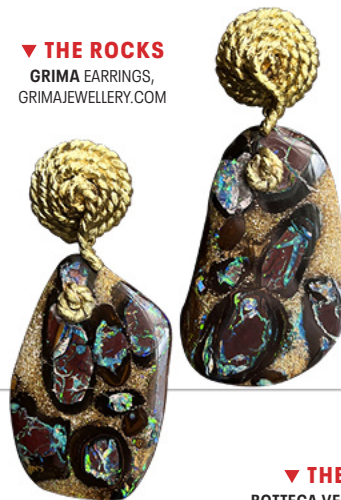
▼ THE ROCKS GRIMA EARRINGS, GRIMAJEWELLERY.COM