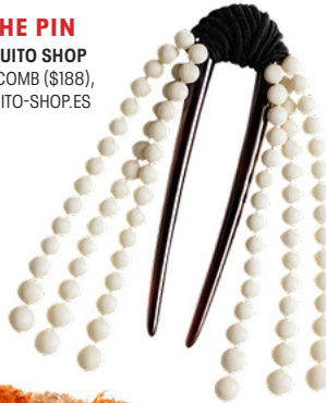
▶ THE PIN MOSQUITO SHOP CANDE COMB ($188), MOSQUITO-SHOP.ES