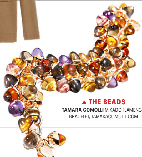
▲ THE BEADS TAMARA COMOLLI MIKADO FLAMENCO BRACELET, TAMARACOMOLLI.COM