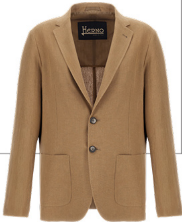
▼ THE BLAZER HERNO BLAZER ($1,035), US.HERNO.COM