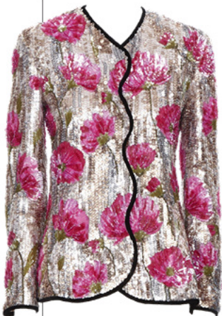
◀ THE DINNER JACKET VALENTINO JACKET ($21,000), VALENTINO.COM

THE RIDE This month the Venice Simplon-Orient Express, a Belmond Train, launches a new route from Paris to the Amalfi Coast. MAY 4-7, BELMOND.COM