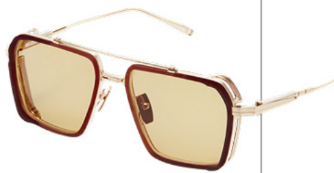
▲ THE SHADE AKONI TIROS SUNGLASSES ($1,230), AKONI.COM