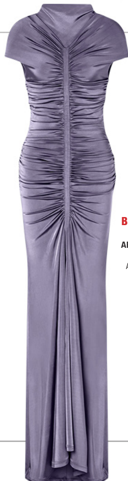
◀ THE BLACK TIE GIORGIO ARMANI DRESS ($3,995), ARMANI.COM