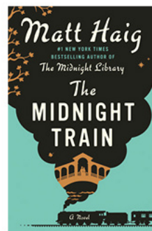
◀ THE READING THE MIDNIGHT TRAIN BY MATT HAIG ($30), PENGUIN RANDOM HOUSE.COM