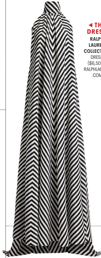
◀ THE DRESS RALPH LAUREN COLLECTION DRESS ($6,500), RALPHLAUREN.COM