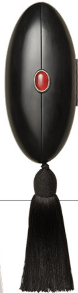
◀ THE CLUTCH SOPHIE BUHAI CYCLOPS MINAUDIERE ($3,600), SOPHIEBUHAI.COM