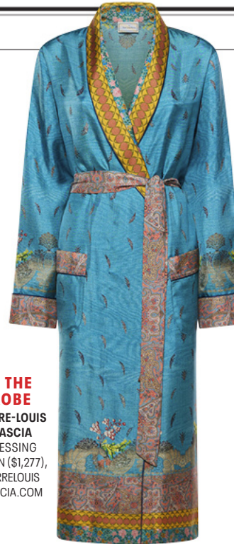
▶ THE ROBE PIERRE-LOUIS MASCIA DRESSING GOWN ($1,277), PIERRELOUIS MASCIA.COM

THE RIDE This month the Venice Simplon-Orient Express, a Belmond Train, launches a new route from Paris to the Amalfi Coast. MAY 4-7, BELMOND.COM