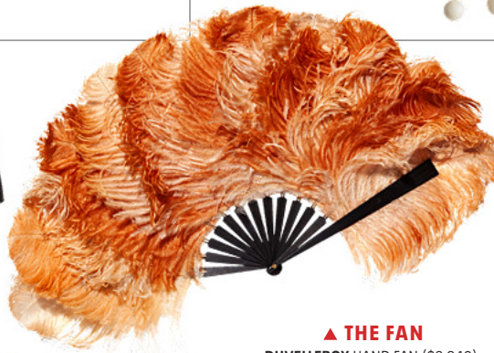
▲ THE FAN DUVELLEROY HAND FAN ($3,940), EVENTAIL-DUVELLEROY.FR