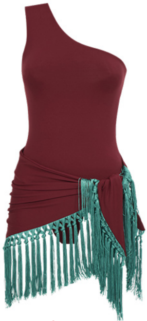
▲ THE SUIT TALLER MARMO YACARE SWIMSUIT ($630), TALLERMARMO.COM