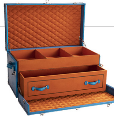
▲ THE TRUNK TRUNKS COMPANY JAIPUR STEAMER TRUNK, TRUNKSCOMPANY.COM