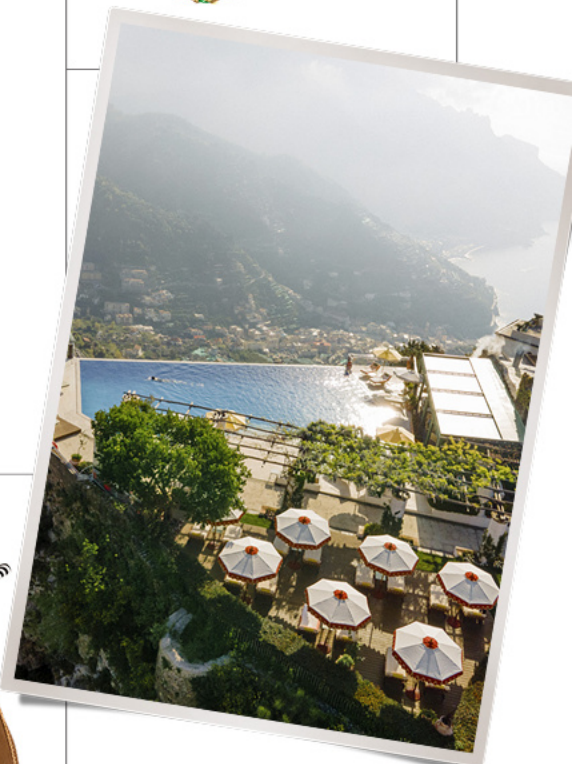
THE IDYLL After a stop in Pompeii, the journey concludes with two sumptuous nights at Caruso, Belmont's 11th-century sprawl in Ravello.